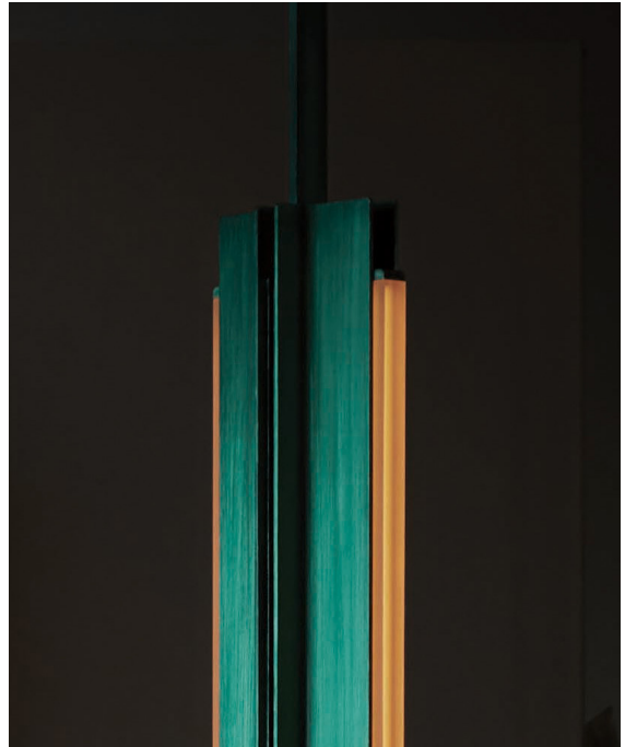
Pictured in Hand-Stained Green with Amber Lens