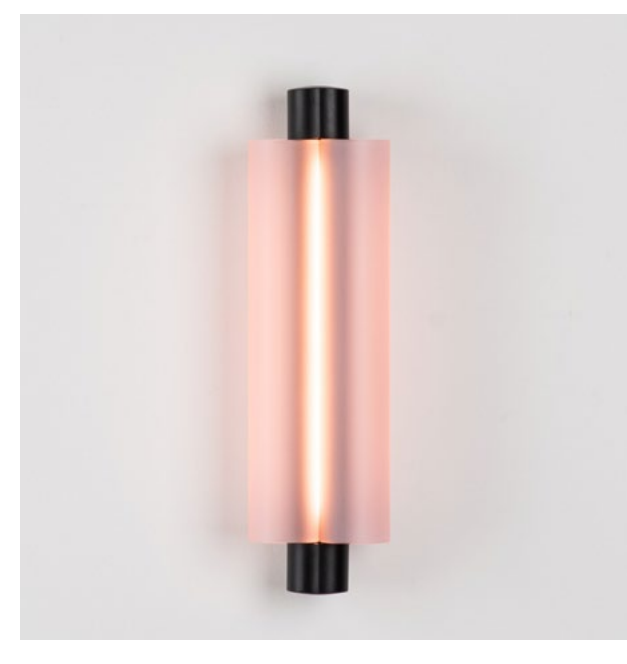
ANODISED GOLDEN | FROSTED WHITE