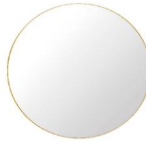
// Polished Brass