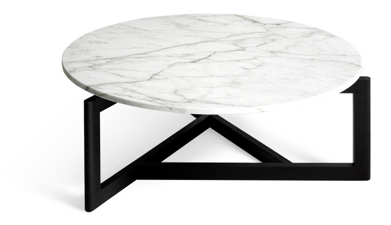
H 39,5 cm (glass) /H 40 cm (marble) /H 39,2 cm (MDI)

TOP IN COMPOSITE: MDI composite, 12 mm thick.