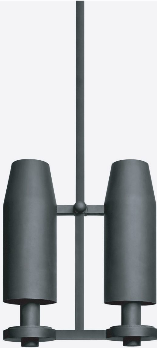
CHAMBER PENDANT TWO Hand Finished Bronze