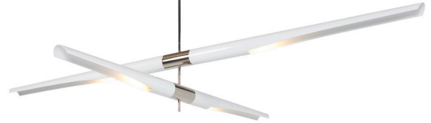
Shown above with 2 tiers